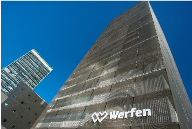
Headquarters Werfen Tower in L'Hospitalet de Llobregat, Barcelona