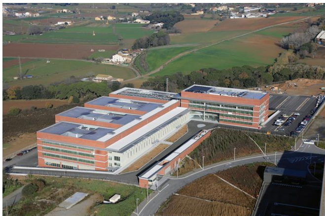
New Biokit technological center in Liçà d'Amunt, Barcelona